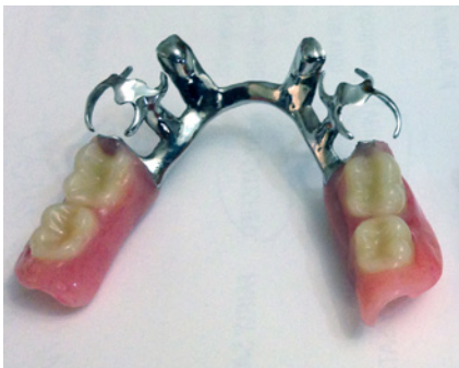
The Patient’s Metal Removable Partial Denture (Lower)